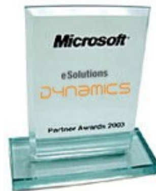
Microsoft Competency Award Winner

In addition to the promotion and implementation of Microsoft Dynamics products, eSolutions Dynamics offers professional support services. These services comprise an integral part of our core business and ensure that our customers get the most out of their investment. The ongoing support, training and consulting that our customers receive increases the value of their solution, ensuring that it remains a fundamental tool for driving their growth and success. eSolutions Dynamics' priority is to deliver outstanding service with commitment and caring. Our goal is to help your business reach its full potential.