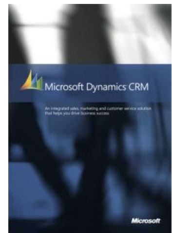
Microsoft Dynamics CRM: A Fast, flexible and affordable Customer Relationship Manager